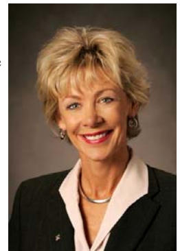
NCEDA President 2009-2010

I look forward to "connecting" with you soon!