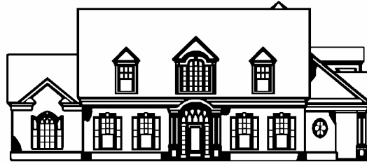
Zebulon Chamber of Commerce

The Zebulon, NC Chamber of Commerce has an exciting career opportunity for an: