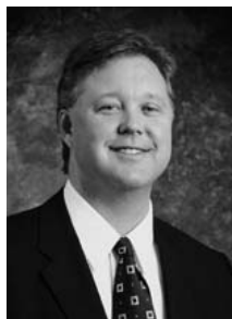
Brian France President, NASCAR